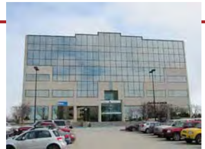
1400 W Benson

1400 W Benson: We have two new tenants in the building – “McKinley Mortgage” on the first floor and “Fred Adkerson, Inc.” on the fifth floor. We welcome them into the building. We are working to fill the 2nd floor – ResCare is interested in about half the floor, we have Waddell & Reid interested in about 3,000sf, which leaves about 3,000sf still vacant. We are painting the lobby on the lower level of the building, continue to work with Thyssen Elevator on repairs and improvements on the elevators, and have some concrete work scheduled for the south end of the property. The bathrooms on the 4th floor were the first to be updated, we begin work on the fifth floor bathrooms shortly.