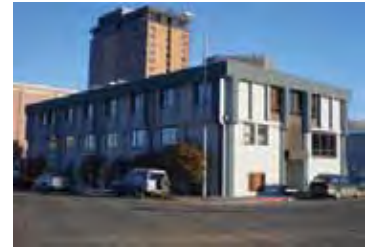
943 W 6th Avenue

943 W 6th Avenue: We have leased the third floor of the building and half of the second floor to a law firm by the name of “Weidner & Associates”, they are looking to expand into the remainder of the second floor. ASHPIN, a former tenant in the building, is interested in coming back to occupy the two small spaces on the first level of the