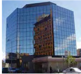
900 W 5th Avenue

900 W 5th Avenue: Zookaware, the tenant on the 1st floor of the building has abandoned their space, our legal counsel is working on retribution, in the meantime, Bradley Reid and Associates, also on the 1st floor of the building, is interested in expanding into Zookaware’s space and the State of Alaska is also considering the first floor space. We hope to have that space leased soon.