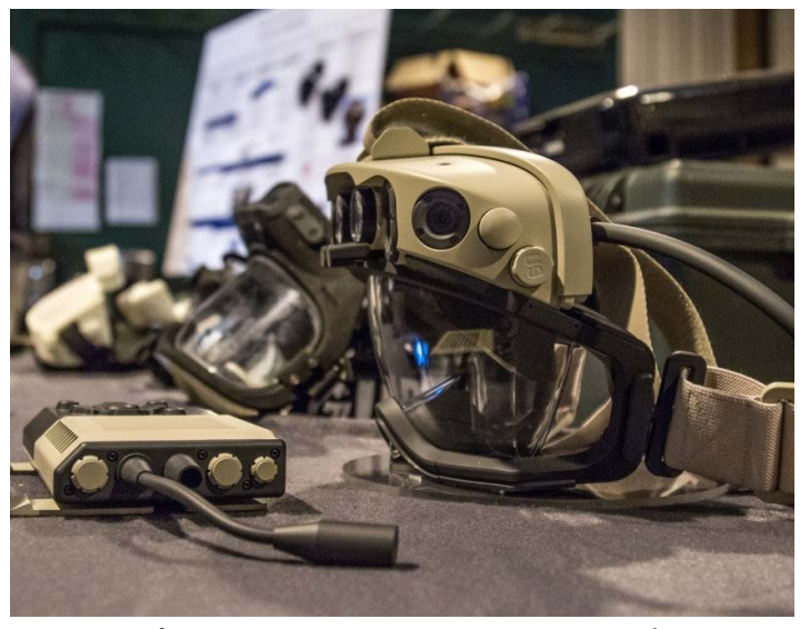
Sugpiat Defense, LLC tests IVAS equipment to enhance safety and mission effectiveness for our warfighters.

may include placing sensors in a variety of locations so a soldier might be able to see the view from a sensor mounted on a drone and use it to locate fellow soldiers or enemy combatants. These applications suggest putting the sensors, rather than soldiers, in harm's way. It is a way to deliver a platform that will keep soldiers safer and make them more effective.