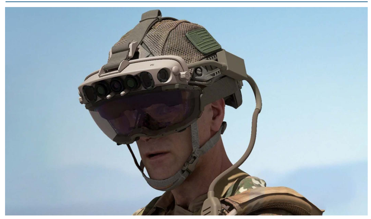
The IVAS equipment is the ruggedized military form factor with integrated low light and thermal sensors, Tactical Assault Kit (TAK) software and maps, and rapid target acquisition.

The IVAS technology places objects such as maps or video displays, such as a hologram overlaid on top of the real world in front of the soldier. This device will allow the soldiers to interact using hand and voice gestures. IVAS is said to help soldiers' sight and identify enemy combatants, as well as provide night vision and thermal imaging. The sensors will act as external eyes, their view accessible through the headset. The Army is in the beginning stages of understanding everything the IVAS system can do for soldiers and Sugpiat Defense is assisting in that testing while also working to improve the device's cyber security.