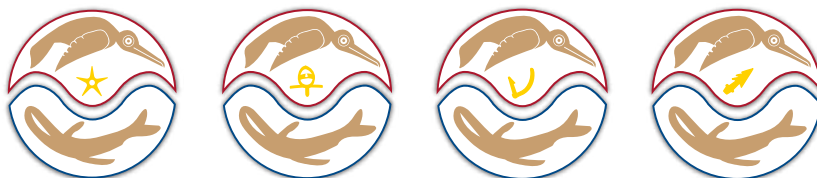
AKHIOK-KAGUYAK, INC. & SUGPIAT FAMILY OF COMPANIES Real People, Providing Real Solutions

We have achieved our goal of aligning with Army Futures Command, and we are now providing leading edge solutions to the DoD. With your continued support, our subsidiaries will acquire many more Government contracts. This will allow us sustainability and longevity. In turn, this will enhance shareholder benefits for the future.