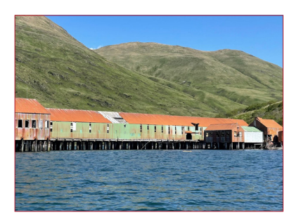
Moser Bay Cannery

As an Alaska Native Corporation, our land represents not only our largest asset, but it is AKI's heritage and provides for a way of life that is important to the culture of our shareholders. Even though our focus is on