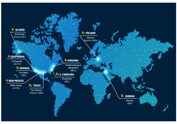
AKI & the Sugpiat Family of Companies have work site locations around the world.

Our team also completed ISO Certifications 9001, 20000-1 and 27001 and is working through CMMI Level 3. These points are important because together with our highly talented staff, these certifications give us a significant competitive advantage. We are now a revenue-generating company with massive potential to keep going. While we are so proud of what we've accomplished in the last three years, we are not sitting still. We continue to grow and expand both nationally and internationally to build a robust government services operation.