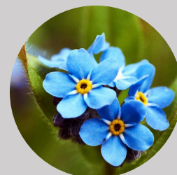
Beverly Thompson January 29, 2025